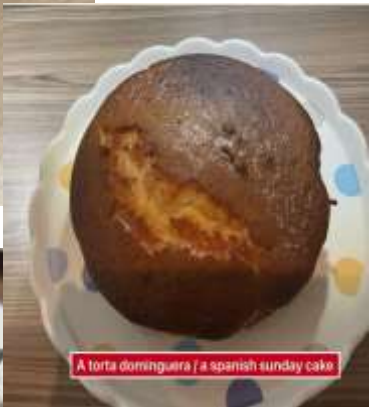
A torta dominguera / a spanish sunday cake