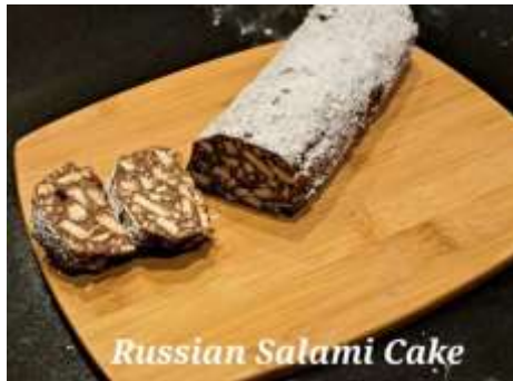
Russian Salami Cake