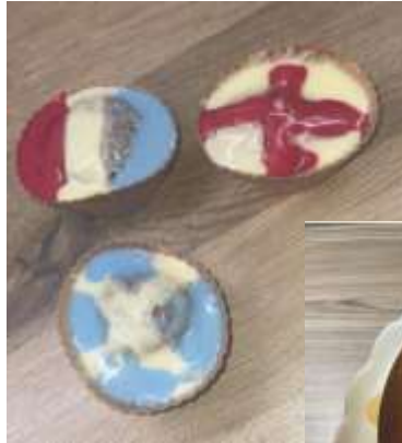
my french flag chocolate cake