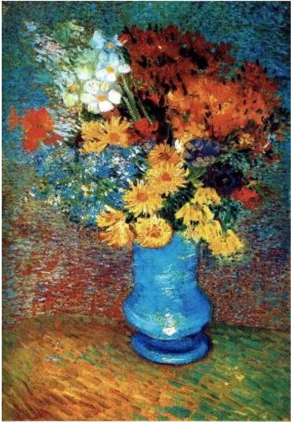
Vincent Van Gogh 'Vase with Daisies and Anemones. Paris. Summer 1887 .Oil on canvas 61x38cm